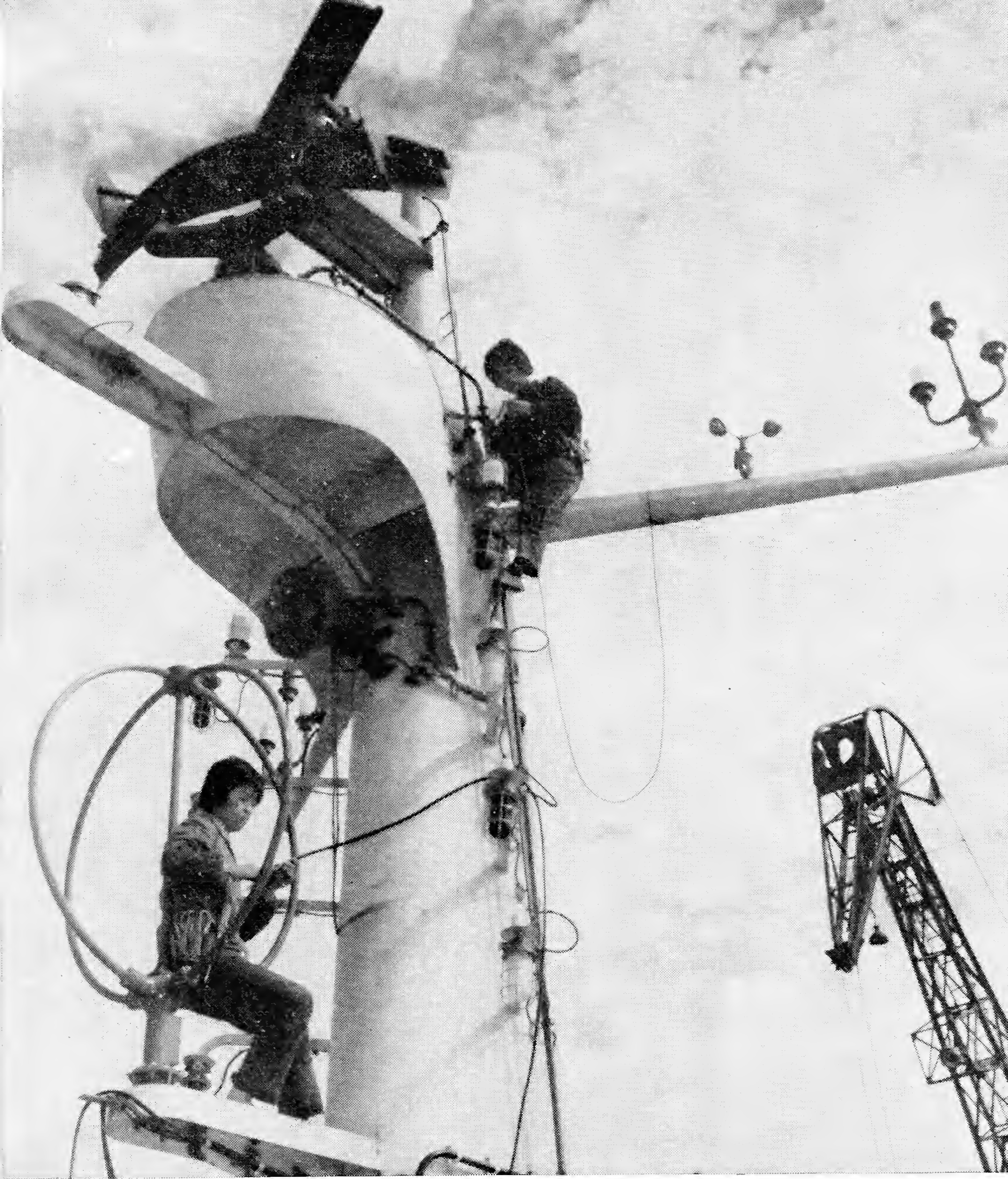
"Anything men can do, women can do too." Girl workers of the Hutung Shipyard, Shanghai, on the job atop a high mast.